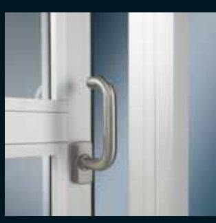
Optional Positve Latch Handle