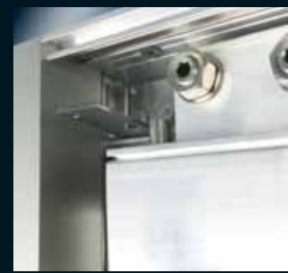
Unique Latching Feature

DORMA Automatics offers a complete line of ICU manual sliding doors for special care facilities such as hospitals and surgical centers. The DORMA ICU allows for continuous observation of patients, while allowing quick and easy access during emergency conditions.