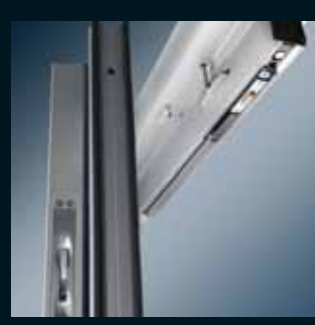
Standard Full Breakout