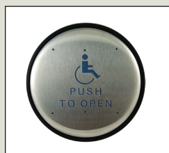
DX3339-060 "PUSH TO OPEN" TEXT & ISA ICON