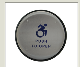
DX3339-171 "PUSH TO OPEN" TEXT & ALTERNATE ISA ICON