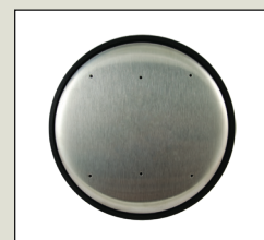
DX3339-063 PLAIN FACE