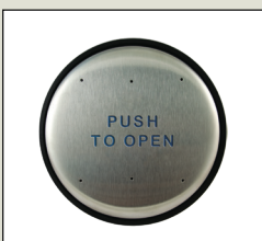
DX3339-061 "PUSH TO OPEN" TEXT ONLY