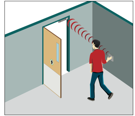
Request to exit