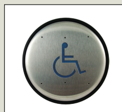
DX3339-062 ISA ICON ONLY